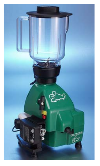
The Original Portable Gas Powered Blender

www.tailgatorzone.com www.totallygross.com